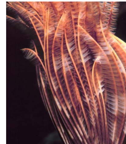
[Photo at right: Caribbean reef sea lily; courtesy of NOAA Image Library]