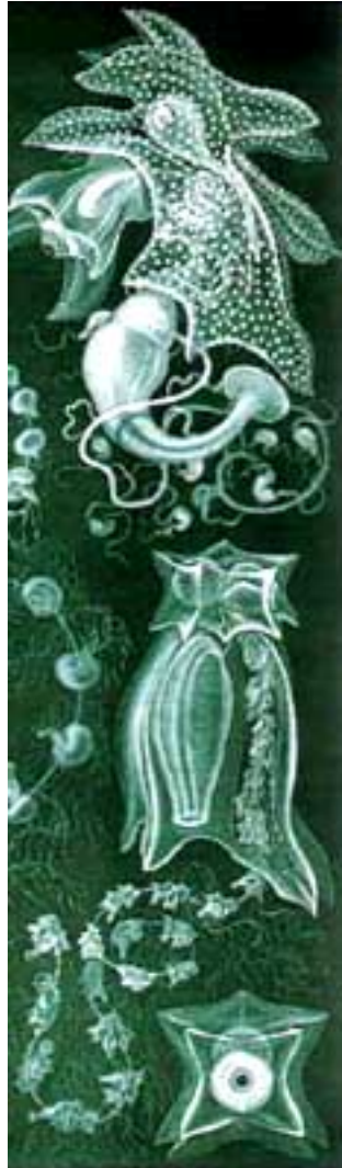
[Image above, Siphonophorae, from the drawings of biologist/artist Ernst Haeckel in public domain.]

They will contribute by creating and donating unique evening dresses inspired by the movement, color, shape and patterns of life beneath the sea.