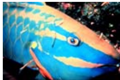
[Photo: spotlight parrotfish supermale, courtesy of NOAA Image Library]