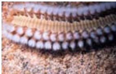
[Photo: Caribbean reef clam worm, ]