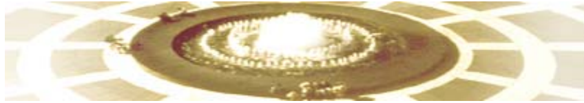
[Photo: The Revson Fountain ]